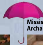
Mississippi Valley Archaeology Center