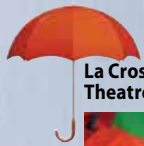
La Crosse Community Theatre