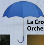
La Crosse Symphony Orchestra