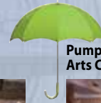
Pump House Regional Arts Center