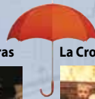
La Crosse BoyChoir