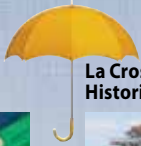
La Crosse County Historical Society