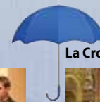
La Crosse Chamber Chorale